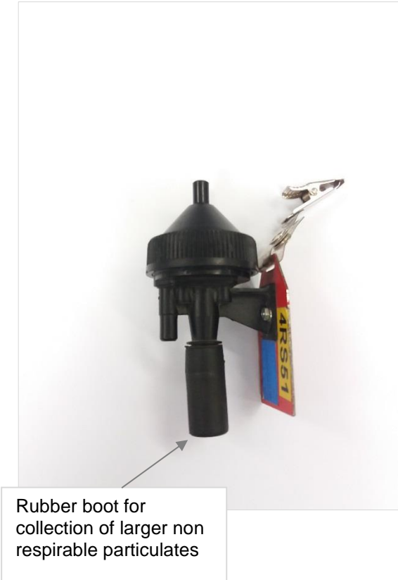
Figure 4. Examples of air samplers used for collecting airborne dust.