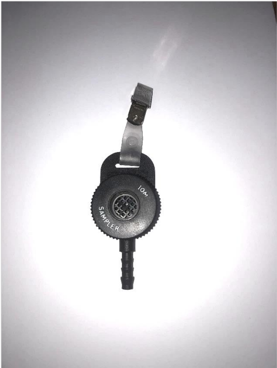
Figure 2. Impactor Heads to monitor PM 2.5 and PM 10 aerodynamic diameter dust fraction size.